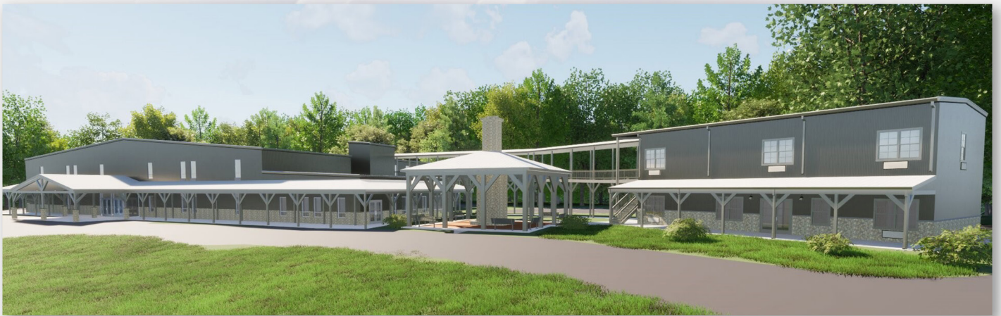
Rendering of Phase 1 of the build at Camp Utopia

Construction has begun at Camp Utopia! The building to the right is currently under construction. This building will have 11 hotel-style rooms to give additional housing for camp staff and rentals. Coming soon, is the upgrade to the façade of the current main building, addition of a much needed elevator, as well as adding on to the building to house the new canteen area for camp. Your giving continues to build the vision for future generations.